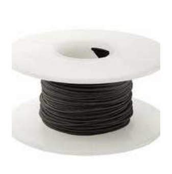
Picture 6: Black 3502 can be an excellent choice for the coloration of cables.

The unique experience and knowhow that Plastika Kritis has developed in the production of black masterbatches assures that these proposed solutions will meet even the strictest customer requirements.