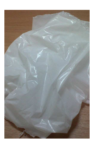
Picture 2: Filler 5706 can be loaded up to 30% in a breathable film formulation.

Filler 5706 completes the range of Kritilen Filler masterbatches, consiisting of Filler 5804, 577, 5801, 5701 and 565, that can be used in HDPE or MDPE t-shirt bags at high addition rates.