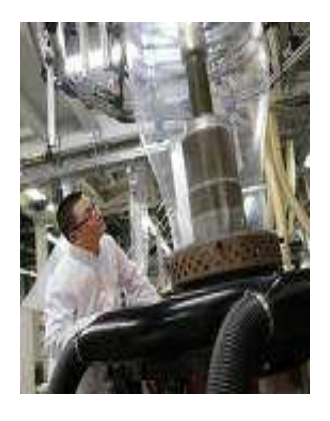
Picture 4: Filler 5771 has a minimum impact on the mechanical properties of mLLDPE films

The recommended addition rate of Filler 5771 could be at the level of 10%-30%, depending on the film thickness and processing equipment.