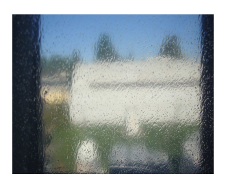
Picture 3: The new masterbatch 001 ПОАБ25 creates visible antiblocking spots on the polyethylene film.

The ultra high molecular polyethylene creates visible spots with a diameter of 80-100mic in the end product, increasing its antiblocking and antislip properties.