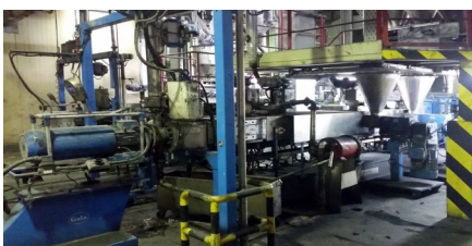
Picture 4: Plastika Kritis has significantly increased its black masterbatch capacity with the new mega-compounder.