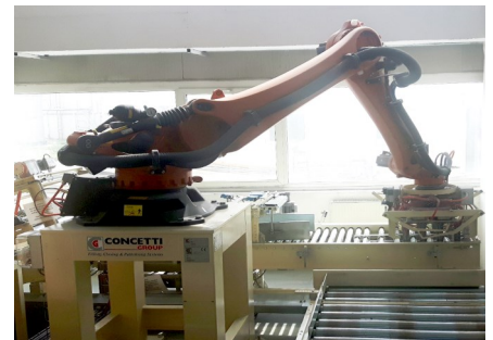
Picture 1, 2 and 3: The Romcolor's mega-compounder for whites and fillers uses silos for the polymers feeding (left). The line is equipped with state of the art upstream and downstream equipment (middle) and its packaging is supported by an industrial robot (right).