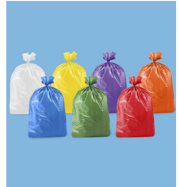
Picture 8: Malodors are reduced with the use of special Global Colors fragrance masterbatches in garbage bags

Kritilen® 1409 Citronella INS was developed in order to repel insects from plastic end products. It is particularly recommended for garbage