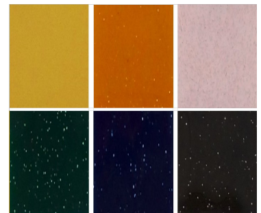
Picture 12: The Global Colors special effect masterbatches can create unique colors in plastic articles.

All the Global Colors labs have access to the latest pigment developments and can propose modern and vibrant color effects.