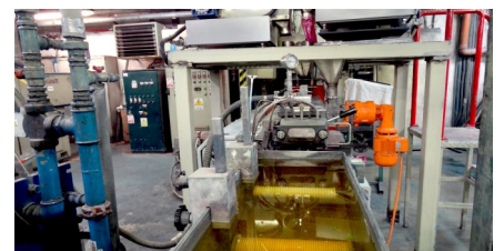
Picture 6: The modern production line for color masterbatches makes Global Colors Polska even faster in small batches production.