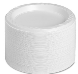
Picture 9: Filler 5809 imparts significant improvements in plastic dish recipes

High addition rates of Filler 5809 can be achieved, e.g. up to 30%, making this masterbatch as the ideal additive for the production of polystyrene disposable dishes.