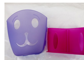
Picture 7: Fancy semi-transparent Kritilen® colors give value to modern style houseware items

The Plastika Kritis color specialists are able to develop and offer such tailor-made color proposals that allow end manufacturers to differentiate from their competitors.