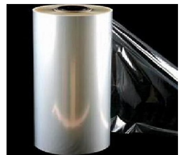
Picture 10: Global Colors offers an excellent masterbatch range for BOPP films.

“Plastika Kritis also offers special BOPP masterbatches based in PP-copo carriers, proposed for use in heat sealed or metallized films. Upon customer demand, Global Colors can develop tailor-made solutions for BOPP film manufacturers. Such solutions involve the use of certain additives or combination of additives, which can be dispersed in adequate polymeric carriers.”